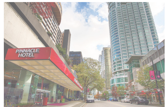
Pinnacle Hotel Harbourfront